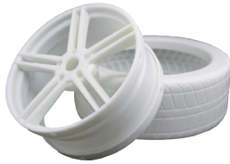
Tire Model Sample Piece